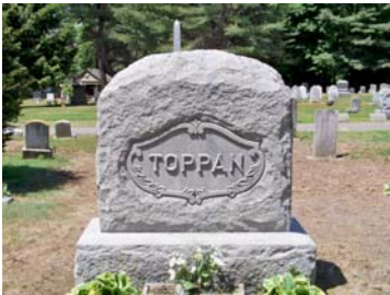
Toppan Family Stone, High Street Cemetery, Hampton, NH